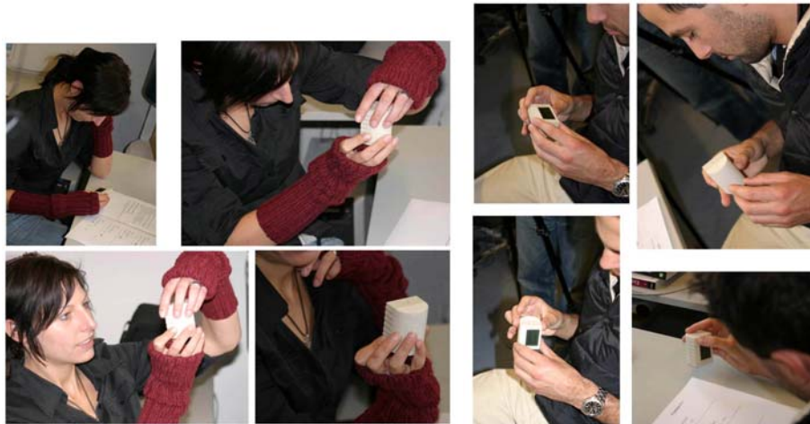
Fig. 3. The test person on the left hand side used the prototype as anticipated but first she used uncomfortable display positions till she figured out a better one. The other test person held the display in such away that it was not possible for him to see the text on the display

Most of them were very interested in the concept of sending messages to places instead of sending them to specific persons. Furthermore it was often mentioned that the system should be extended in such a way that SMS and fixed displays are integrated in the next iteration.